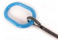
Master link (1 lanyard)