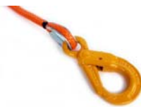
Self-closing hooks (3 lanyards)