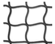
Knotless Nylon Netting