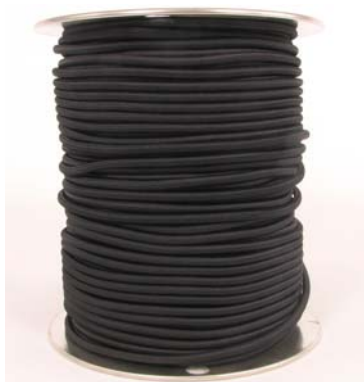
# SC080504 : Black elastic rope