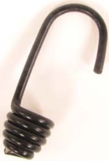
# SHM04 : Elastic rope hook