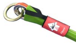
Stainless steel thimble with round ring at top end