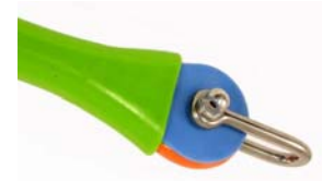
Non-metallic thimble and stainless-steel shackle at bottom end