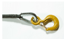
Crosby® hooks (3 corners)