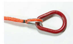
Pear-ring (1 corner)