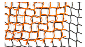
Reinforced center for balanced loading