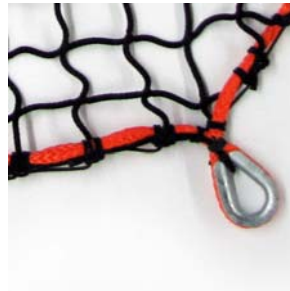
Detail of octagonal shape Conforms better to loads