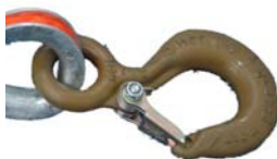
Crosby® alloy hooks on 4 500 lbs nets