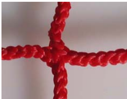
Knotless nylon netting showing no evidence of breakdown after exposure to 500 hrs QUV, and prior to being tested for residual tensile strength.

The first study, conducted in 2002, was a comparative analysis involving knotted polyethylene and knotless nylon (polyamide) netting. The result of this study, which subjected net samples to accelerated weathering in a QUV chamber, was to observe that after 500 hrs of exposure, knotted polyethylene had lost 90-100% of its tensile strength whereas knotless nylon had lost only 12% of its tensile strength.