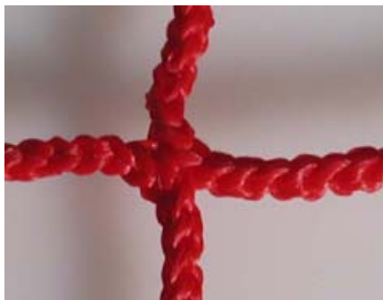
Knotless nylon netting showing no evidence of breakdown after exposure to 500 hrs QUV, and prior to being tested for residual tensile strength.

The first study, conducted in 2002, was a comparative analysis involving knotted polyethylene and knotless nylon (polyamide) netting. The result of this study, which subjected net samples to accelerated weathering in a QUV chamber, was to observe that after 500 hrs of exposure, knotted polyethylene had lost 90-100% of its tensile strength whereas knotless nylon had lost only 12% of its tensile strength.