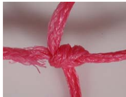
Knotted polyethylene breakdown after exposure to 500 hrs QUV, and prior to being tested for residual tensile strength.