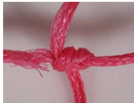
Knotted polyethylene breakdown after exposure to 500 hrs QUV, and prior to being tested for residual tensile strength.